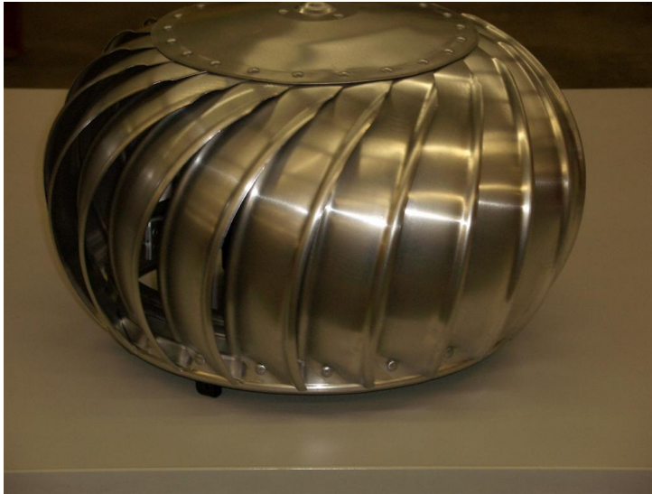
Photograph No.3 Spinaway 500mm throat