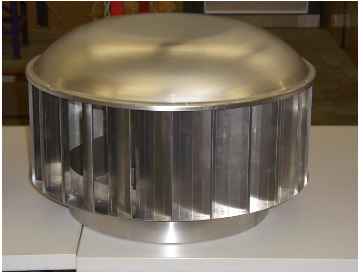
Photograph No.2 Industrial vertical blade 300 mm throat.