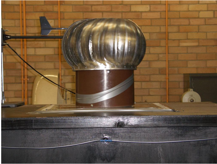
Photograph No.1 Spinaway 300 mm throat

I have been asked by Alsynite Roofing Products Pty Ltd to test the ventilation performance of 3 ventilators being: 1) a Spinaway 300mm diameter. 2) an Industrial vertical blade 300mm diameter. 3) a Spinaway 500mm diameter.(refer to photographs 1-3 below). This took place in the aerodynamic laboratories, UTS.